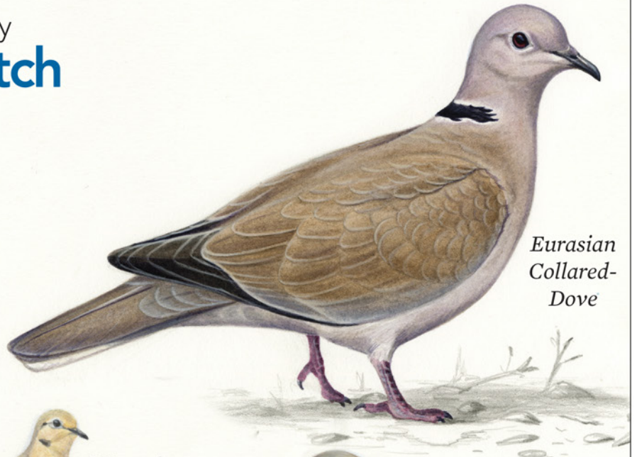
Eurasian Collared- Dove