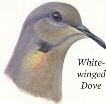
White- winged Dove