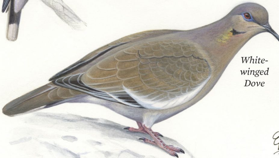
White- winged Dove