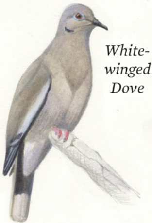
White- winged Dove