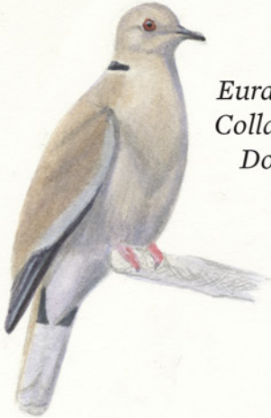
Eurasian Collared- Dove