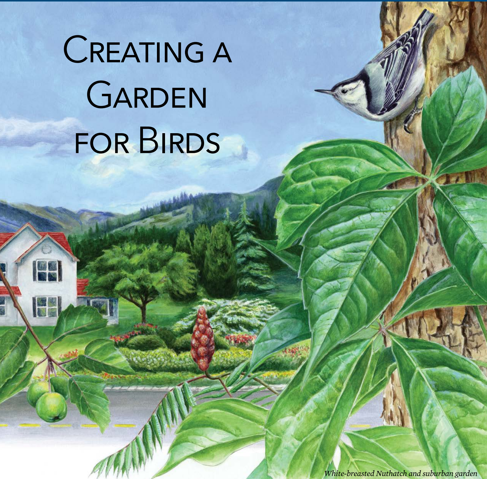
White-breasted Nuthatch and suburban garden

Few things are as interesting and beautiful as songbirds. They brighten up the darkest days of winter, adding music and color to our lives. What can we do to repay them? For starters, we can make our yards more bird-friendly. Never before has suitable habitat for birds been in such short supply. Urban areas are expanding constantly, altering or destroying natural areas. By creating bird gardens, we provide oases for birds in the heart of our cities. Not only the birds benefit. If you make your yard more attractive to birds, you'll have the pleasure of seeing an increasing number and variety of birds there.