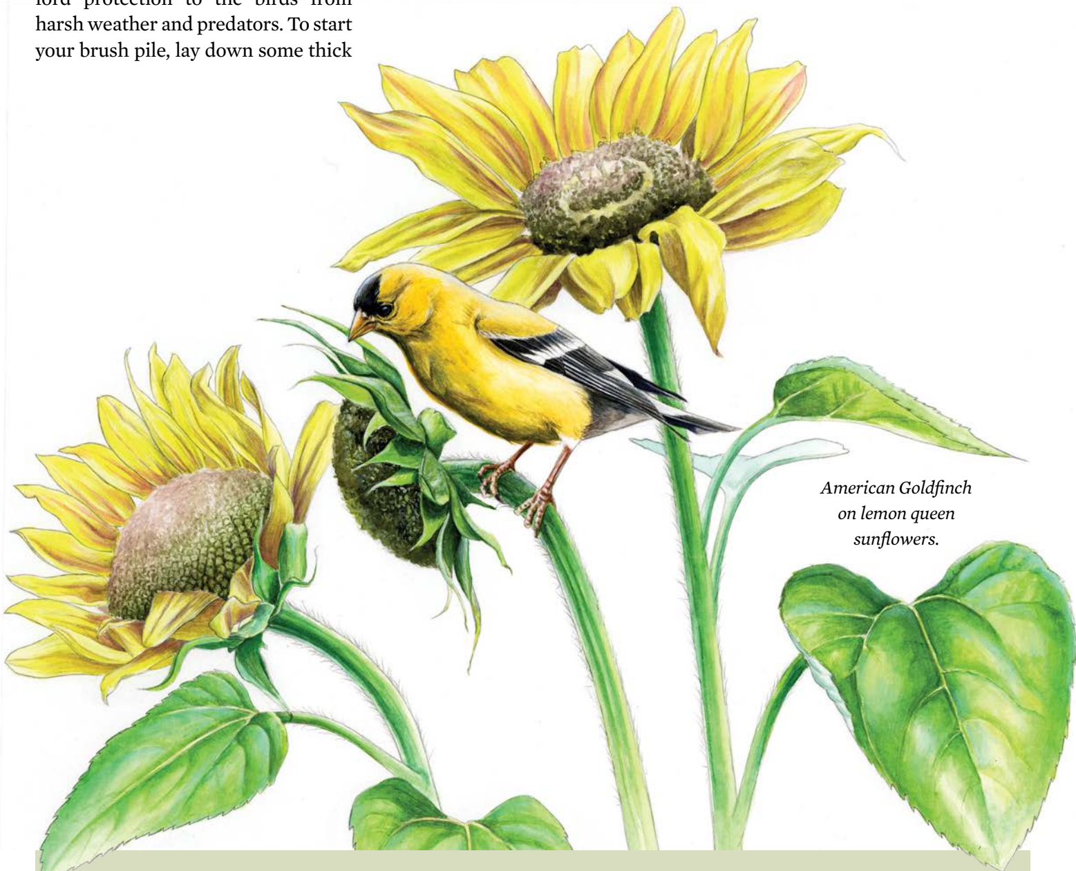
American Goldfinch on lemon queen sunflowers.