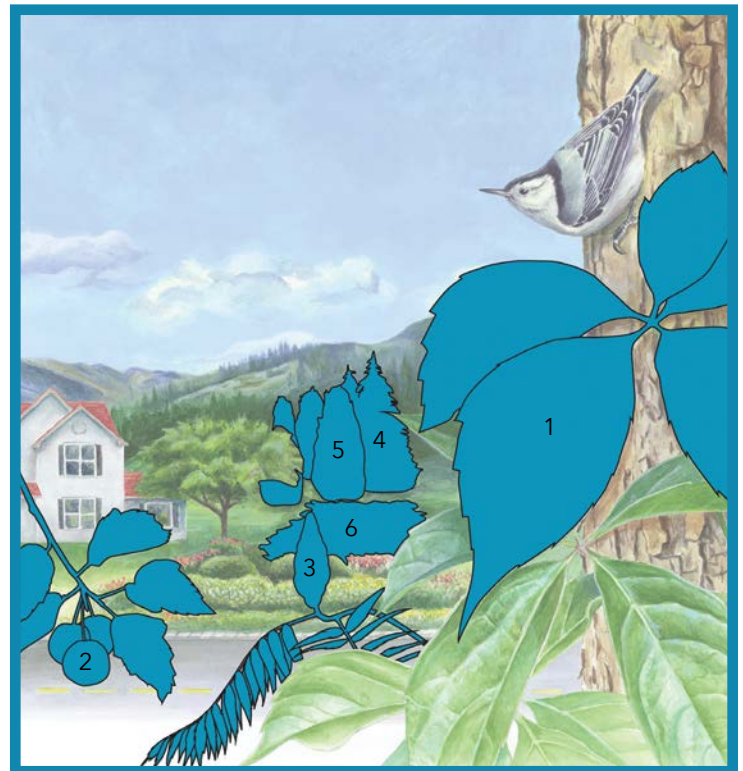
Plants shown on front cover