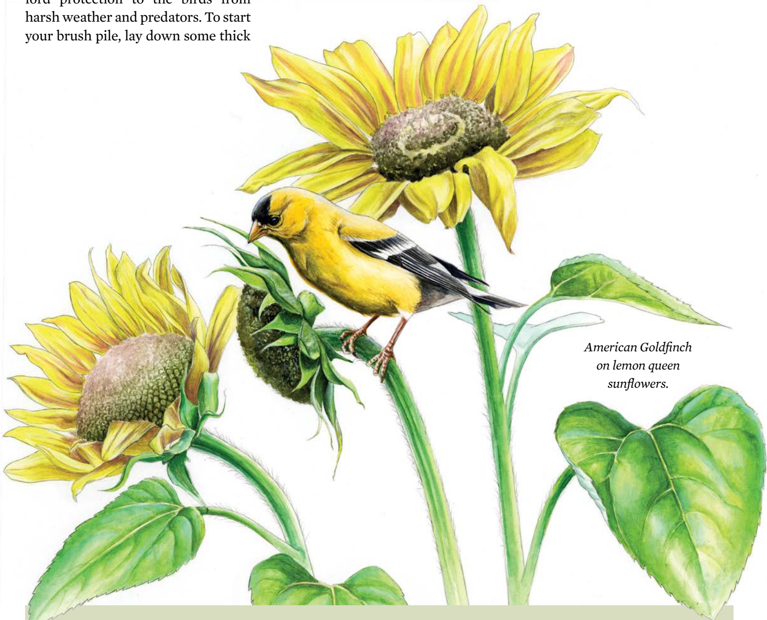
American Goldfinch on lemon queen sunflowers.