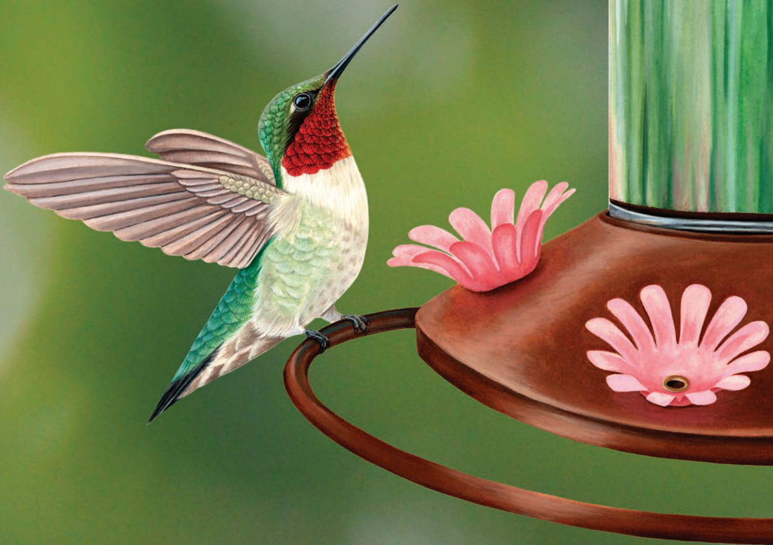
♂ RUBY-THROATED HUMMINGBIRD

The tiniest birds in the world are also among the most fascinating and the easiest to watch, sometimes from inches away in your window feeders. Feeding hummingbirds is fun and rewarding and, when done properly, can also make life easier for hummingbirds. Hummingbirds get quick energy from sugar-water feeders, energy that fuels their search for the insects and flowers which provide most of their nourishment.